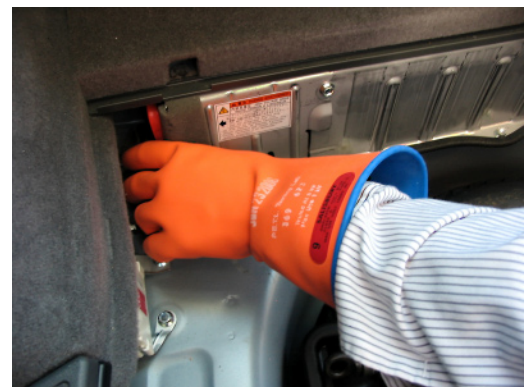
After putting on insulating gloves, the technician disconnects and removes the battery service plug. 2007 Toyota Prius hybrid shown.

Assuming that the vehicle's high-voltage system has been properly shut down, and you are wearing your insulating gloves, the voltage reading can be taken. Before doing so, turn on the meter, select "volts dc", and verify that the meter is working by measuring a known low-voltage current source such as the vehicle's 12 V battery. Faulty meters or leads can produce a false "zero voltage" reading!